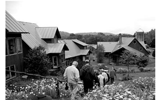
Cobb Hill Cooperative Housing