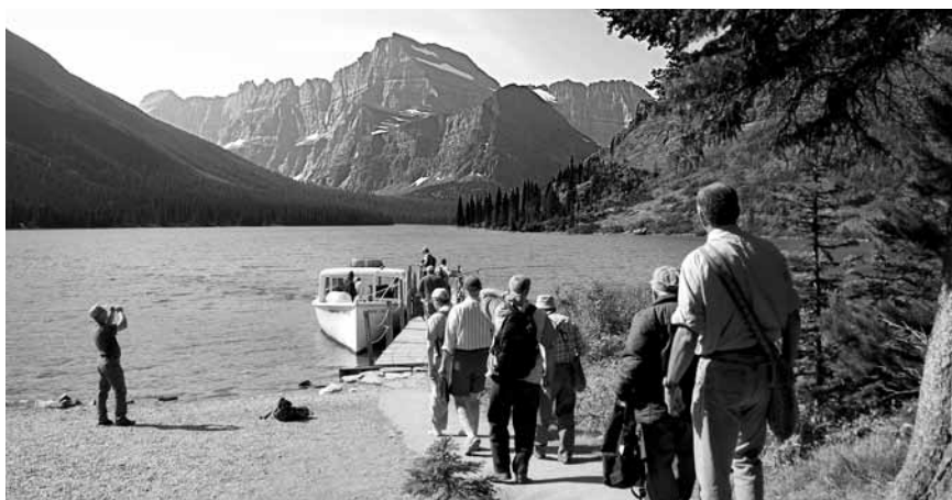
Lake Josephine, Many Glacier, Glacier National Park, Montana