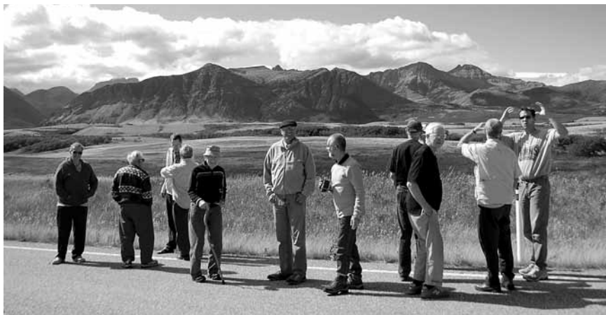
Alberta prairies toward the Rockies, on the road to Waterton