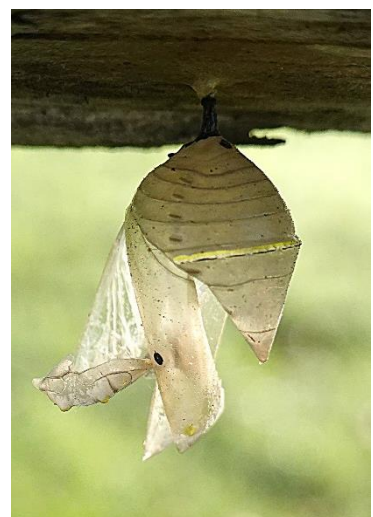
The metamorphosis of the Monarch butterfly from its chrysalis