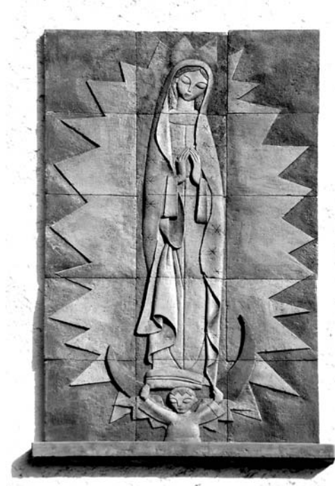
Ceramic bas-relief plaque at the Guadalupe Center, Cuernavaca