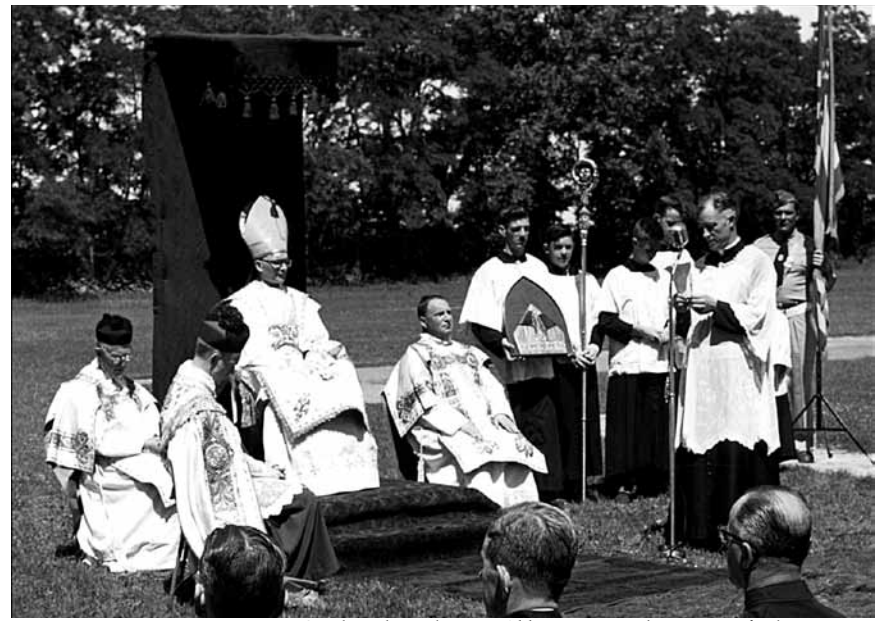
South Park, Burlington, Abbot Leo presiding at Pontifical Mass, 1953

Our scanner is a great gift of contemporary technology and makes it possible to share the contents of a faded and crumpled two-page, 8\frac{1}{2} " x 14" document that might otherwise have gone quite unnoticed. It works wonderfully well but does need a little help in translating some of the blemishes and distortions that creep in with aging: