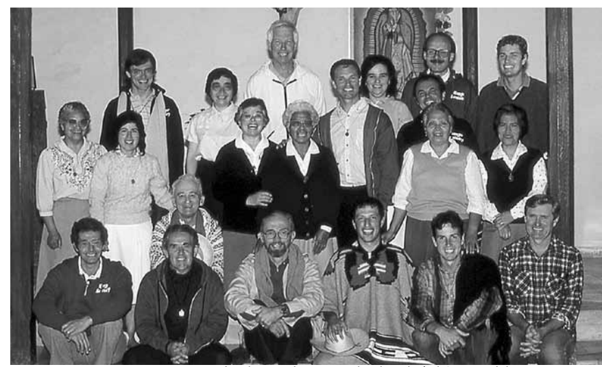
brothers and sisters in the chapel of El Ojite, Hidalgo, Mexico, 1987

The year 2013 marks 60 years since the founding of our monastery. I wonder, as I reflect with gratitude for all the people who, through the years, have touched our lives: What kind of monastic community would we have become if we had not met our Mexican Benedictine Sis-